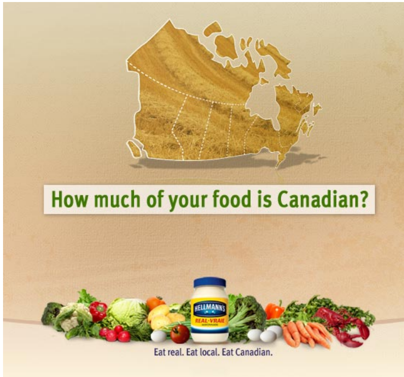
Photo from Hellmann's, (a subsidiary of London-based giant Unilever) "Eat Real, Eat Local" initiative in Canada. Locally sourced ingredients of Hellman's include: water, modified corn starch, soybean oil, vinegar, high fructose corn syrup, egg whites, salt, sugar, xanthan gum, lemon and lime peel fibers, colors added, lactic acid, phosphoric acid, natural flavors.

One such defining factor for local food is that small, local farmers are expected to use "best practices," growing their food organically and creating good labor conditions. And, this is often the case. Besides the important fact that local agriculture means less distance for the food to travel, thus less fossil fuels are consumed to move product to the consumer, there are other ways in which the ecology of local foods is better. Small, local farms are more likely to adopt environmentally friendly practices simply due to the fact that mono-cropping is not a practical or sustainable option for a farm looking to develop a strong consumer base, nor is it practical in terms of maintaining healthy soil. Nutrient cycling is maintained at a local level. Jennifer G Phillips, an assistant professor at the